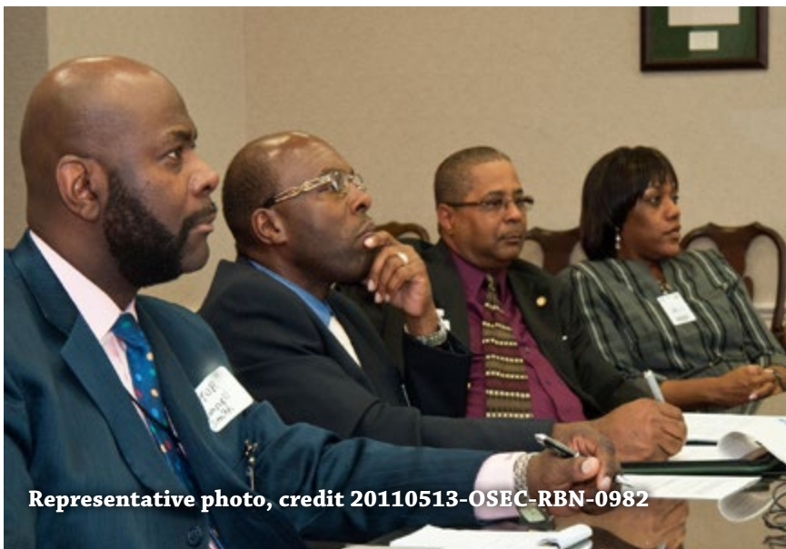
Representative photo, credit 20110513-OSEC-RBN-0982