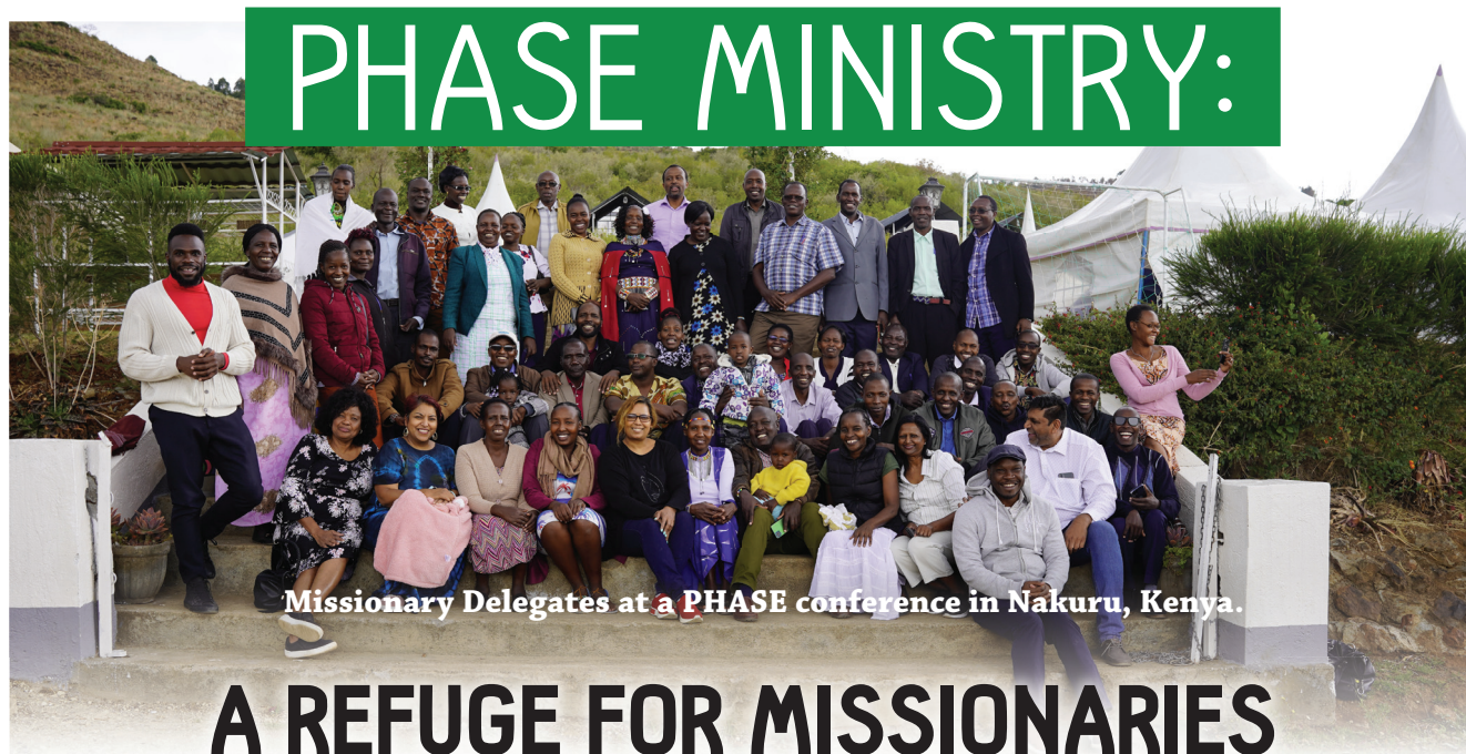
Missionary Delegates at a PHASE conference in Nakuru, Kenya.