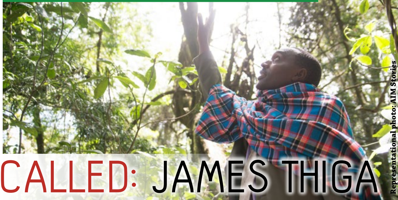
Representational photo: AIM Stories