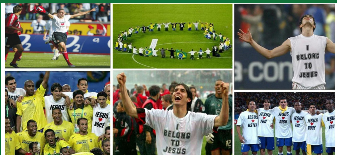
Figure 4: Following the success of Brazil at the 2002 world cup, members of the national team outwardly proclaimed their faith in Jesus Christ to millions of viewers around the world. They went on to visit hundreds of schools across nations telling their unique stories of how their faith in Jesus makes them better sports persons.

That Christian Mission agencies, churches and Christian individuals will partner and rally under a common banner to utilize the opportunities of the Major Sporting Events for a massive outreach. This