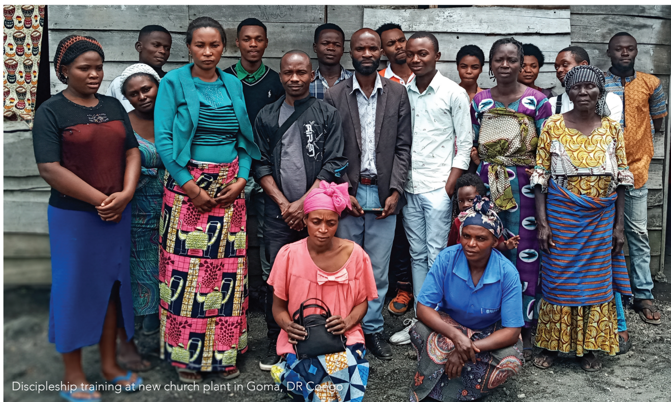
Discipleship training at new church plant in Goma, DR Congo