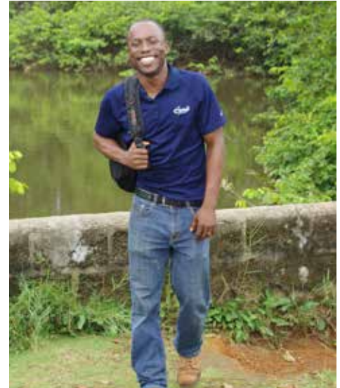
Dexter is stepping out to share the gospel.

is usually sent to the mission board of the Evangelical Church of Liberia (ECOL) to support its ministry activities.