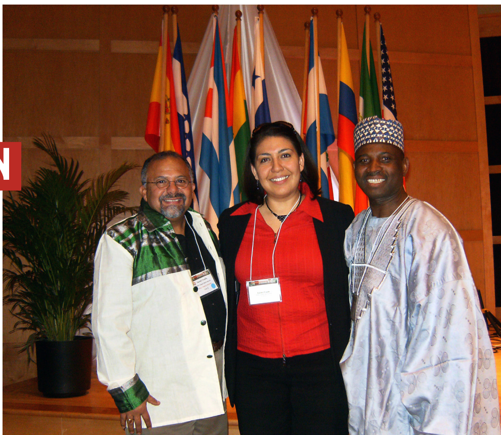
Ethnic America Network Summit in Chicago, USA

G od has an immigration policy with one sole purpose: to place people in locations where they can hear the gospel as they