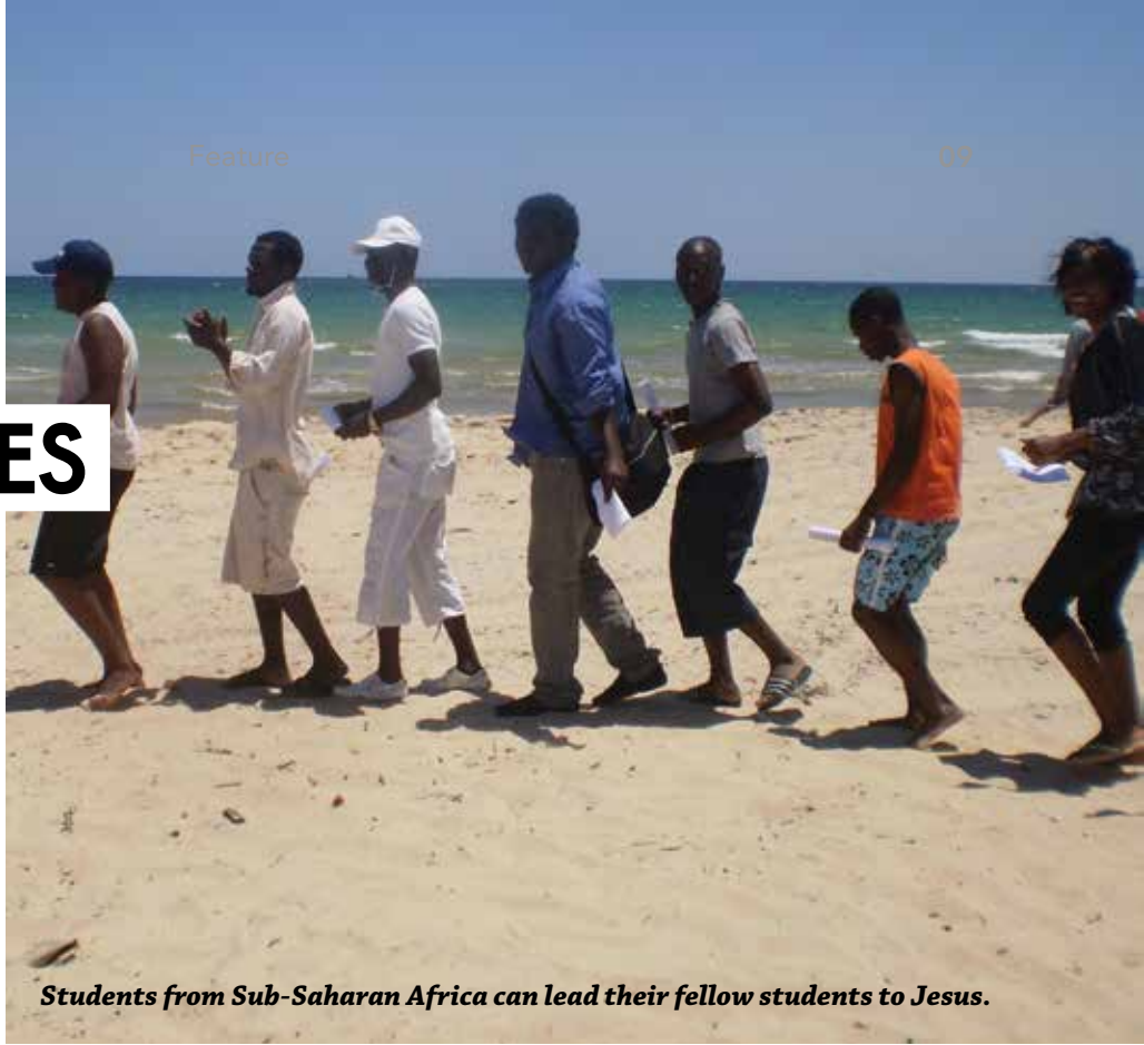
Students from Sub-Saharan Africa can lead their fellow students to Jesus.

Focusing on youth means preparing a generation of future leaders for churches, the private sector, and some public or governmental institutions. By investing our time, energy and resources, we anticipate a positive impact on the local churches and the nations in NA. And of course, at the end of the journey, SSA students are likely to return to their home countries with renewed concern for the lost.